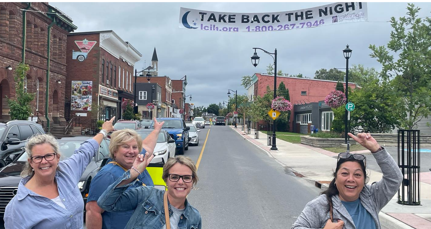
Our brand-new Take Back the Night banner courtesy of Next Gen Sign Specialists