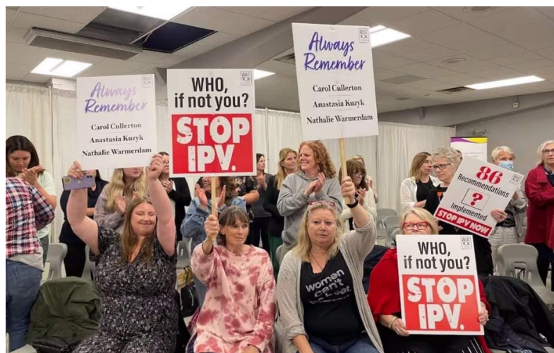
Showing support one year after the Jury Recommendations were released

Join the worldwide effort to end gender-based violence! We've got a range of events and activities lined up from November 25 to December 10. Check our website or social media for more details on all our events. Now's your chance to get involved and stand against violence!