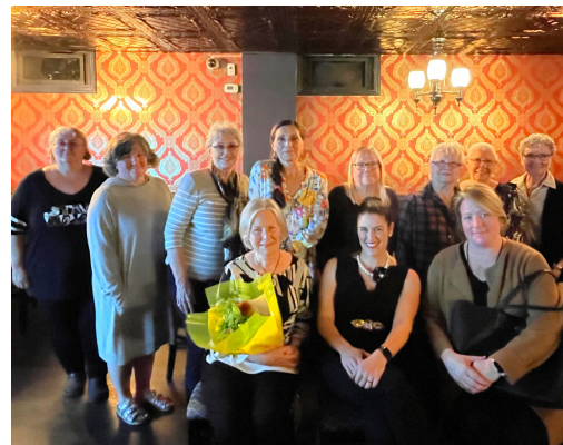
Our As Good As New Team

Volunteer Canada's data highlights a widespread volunteer shortage in Canadian nonprofits, but we've defied this trend. This fiscal year, we proudly welcomed 30 new volunteers, including 5 dedicated high school students. Experiencing an 83% growth in our team, we now have 77 devoted volunteers and 8 Board Members. Despite the challenges of COVID, we celebrated an in-person meeting this spring. Our volunteers, instrumental to our success, contributed an average of 260 hours monthly, yielding substantial cost savings of $7,500 per month and an impressive annual total of $90,000. Their commitment exemplifies their crucial role in advancing our mission.