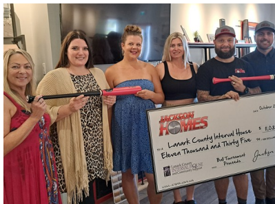
Jackson Homes Presents us with a cheque following their slo-pitch softball tournament fundraiser