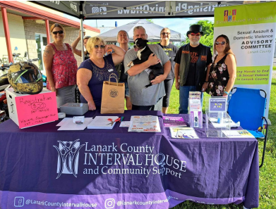
Rising Phoenix held a motorcycle scavenger hunt fundraiser